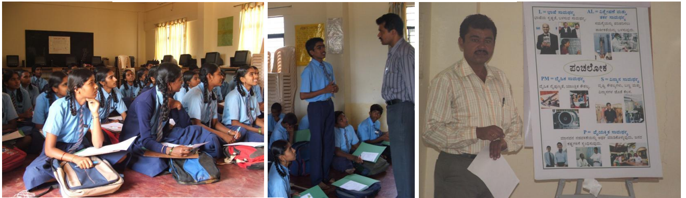
Learning through work sheets